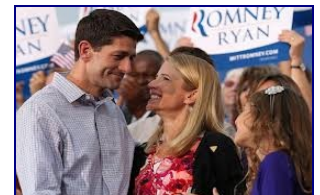
Janna Ryan with husband and Vice Presidential candidate, Paul Ryan

Janna Ryan majored in Spanish at Wellesley College. She graduated cum laude in 1991 and her first job in Washington was as an aide to former Oklahoma Rep. Bill Brewster. She received her J.D. from George Washington University Law School. Unlike Michelle Obama, Janna still holds her attorney's license.