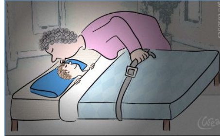
James always felt so safe when Nanny State was around - except when he needed to pee in the middle of the night.

We will be having a Christmas party for our members and details for the party are forthcoming.