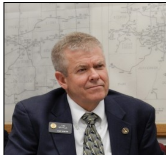
Senator Tim Neville